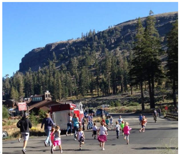
Kids Fun Run Saturday, September 1st, 2018

Thank you to everyone that came out to the Kirkwood Volunteer Fire Department's (KVFD) fundraising events over the summer! Your support is a necessary component in fire department funding and aids in providing for the safety of the firefighters while protecting your home. The 38 th Annual 5K/10K & Kids Fun Run kicked off the weekend the morning of Saturday, September 1 st . 93 runners participated in the race with all of the proceeds benefitting KVFD. The Annual 'Thin Air' Chili Cook Off, sponsored by the Kirkwood Community Association, took place on the Village Plaza after the race was finished. This annual community event featured the region's top chili makers, wineries and breweries, live music by the Wesley Orsolio Band and a Kid's Zone with face painting and a bounce house. Net proceeds benefitted both KVFD and the Kirkwood Rescue Avalanche Dog Foundation. If you couldn't make it to any of our fundraising events over the summer and you would like to make a donation to KVFD, follow this link: https://www.kmpud.com/departments/fire-department/volunteer-fire-department-donation/